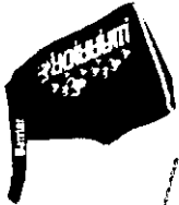
Domination Fight Shorts Blue/White