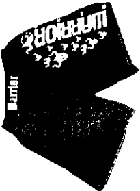
Domination Fight Shorts Black/Red