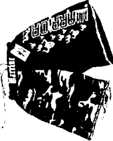
Domination Fight Shorts Army Camo/Black