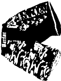
Domination Fight Shorts Urban Camo/Black