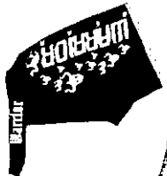
Domination Fight Shorts Black/White